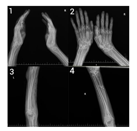
Figure 2. Arterial calcification in both upper extremities giving train-rail appearance. Digital, radial and ulnar artery calcifications can be clearly distinguished.

epithelioid histiocytes, granulomas, and fragmented elastic lamina are findings leading to the diagnosis<sup>3</sup>. None of these were detected in our case, and tunica media calcification and degradation of vascular smooth muscle led to the diagnosis of MMCS.