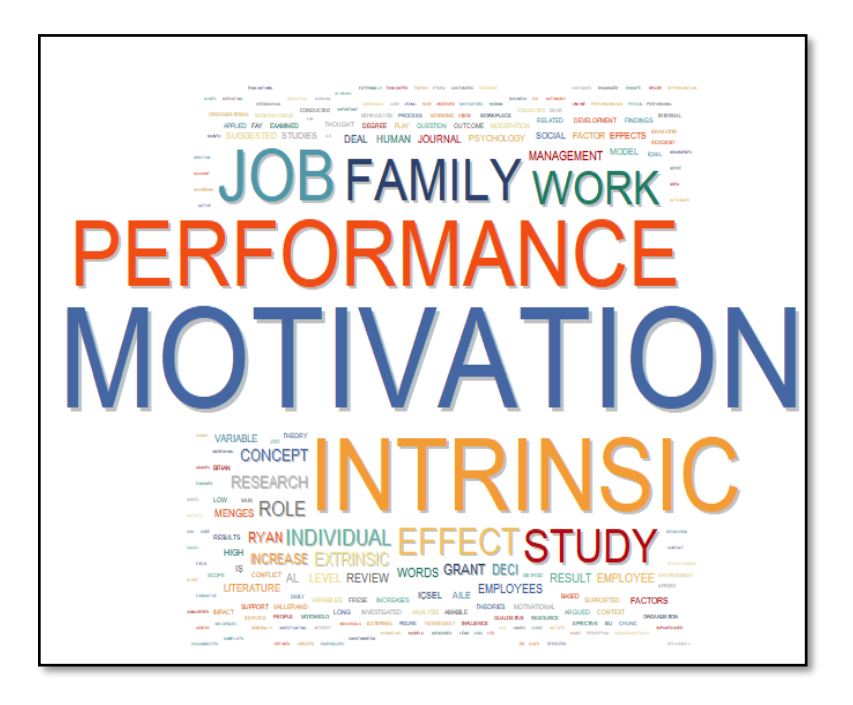
Figure 2. Work Frequencies

Table 2 shows the effect power between the variables. According to these results, when the performance of the individual increases under job performance, the internal performance will also increase at the same rate. But the increase in performance will decrease the support organization. In addition, the results show that there is a strong and negative relationship between intrinsic motivation and support organization. In other words, when internal motivation increases, the individual's need for support organization will decrease. In addition to these, there is a high effect in the same direction between the family and the individual. In other words, the individual is affected by the family. This situation shows the power of the situation variable, which is expressed as family, on the individual.