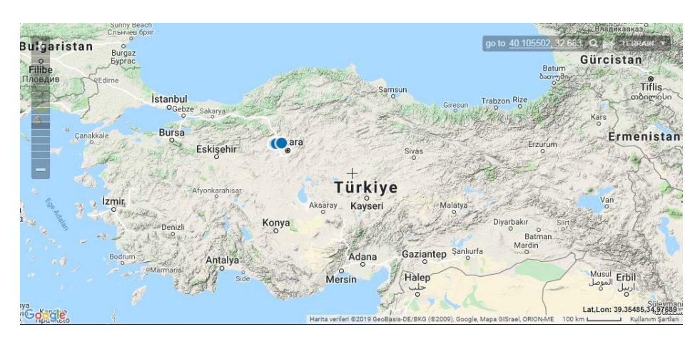
FIGURE 2. Location of three populations of C. damboldtiana .

C. damboldtiana is known from three populations including Ayaş, Kahramankazan and Sincan in Ankara province (Figure 2). It has 8982 mature individuals in total. The AOO was calculated as 16 km<sup>2</sup> and the EOO was calculated as 16 km<sup>2</sup> (Figure 3). The main threats are urbanisation, agricultural and mining activities. The IUCN threat category was found as CR [8] (Table 4).