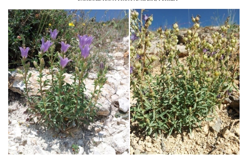
FIGURE 1. Campanula damboldtiana.