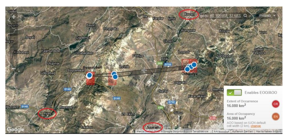
FIGURE 3. Area of occupancy and extent of occurrence of \it C.\ damboldtiana .