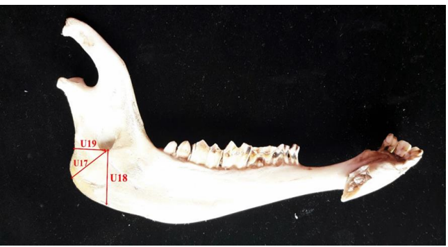
Figure 2. Hasak sheep mandible medial view (U17: The distance between the Foramen mandible and the caudal end point of the Angulus mandible, U18: The distance between the foramen mandible and the base of the mandible, U19: Distance between the foramen mandible and the caudal edge of the mandible).