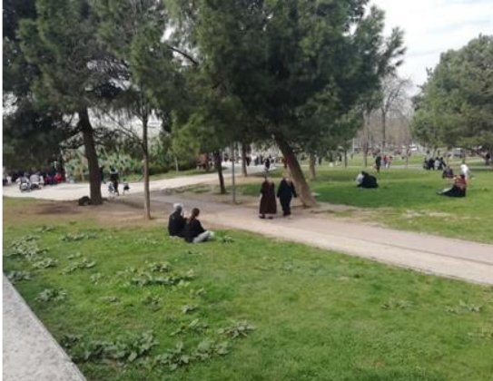
Figure 10. Photographs from Carşamba park show the few number and unprotected seats (Source: author, 2020).