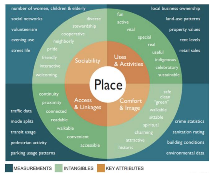
Figure 1: The Place Diagram (Source: http://www.pps.org/articles/grplacefeat/, 2016).