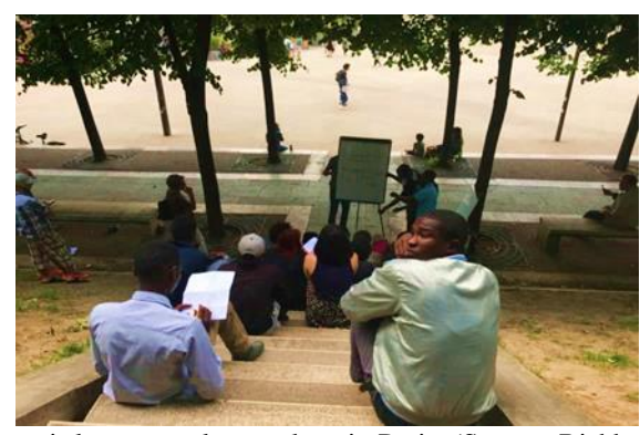
Figure 5: Open-air language class seekers in Paris, (Source: Rishbeth, et al,2017)

Both locals and refugees could view public open spaces differently, the public open space could be a place where refugees feel unwanted or uncomfortable and maybe feel a lack of confidence to spend time for fear of hate crimes. On the other hand, for the locals, open public spaces generate a sense of ownership, care, and concerns about anti-social behavior. It can be said that good public open spaces for refugees should be easily accessible, provide economic, cultural, social activities, and summarize the cultural mix of communities. In addition to that, they should give a welcoming and positive effect to the locals generating a sense of ownership and care (Rishbeth et al., 2017).