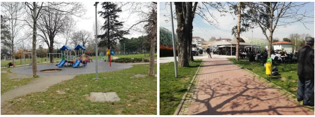
Figure 9. Children's play areas and seating areas near the bazaar in Carsamba Park.

"I cannot find a space to do a lot of activities here... When I want to do some activities or when some of my friends come from outside we go to Kültürpark..." said a 29-year-old man. "I go to the park only on the days of the Bazaar, after shopping I sit in the park, and rest with my family or have a little chat with some friends..." said a 29-year-old lady.