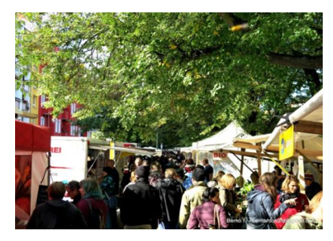
Figure 2. Berlin's bustling canalside Turkenmarkt.

In open public spaces, immigrants and refugees have a chance to develop a sense of place and maintain traditions as well as help building social ties. For example, the Little Haiti Community Garden in Miami, Florida has been seen as a place where the Haitian community uses traditional farming technicalities in producing unavailable products. This place provides an opportunity for cultural exchange (figure 3).