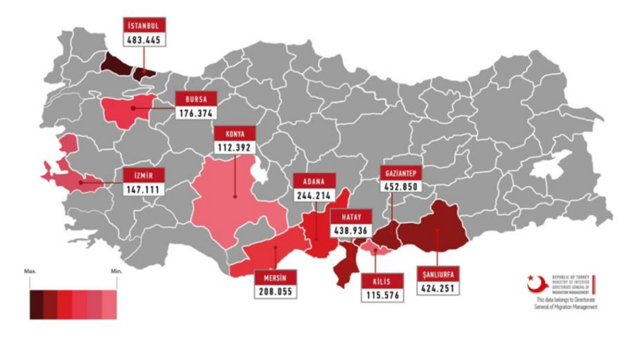
Figure 6: Syrian refugees in the first ten cities.

According to the United Nations High Commissioner for Refugees: "Syria is the biggest humanitarian and refugee crisis of our time." Millions of Syrians have escaped across borders, (the updated data of 31 Jan 2020), 5.681.901 people have fled Syria to seek safety since 2011. According to the last statistics from the General Directorate of Migration Management (GDMM), Turkey hosts the largest number of registered Syrian refugees as 3.671.811 refugees, (GDMM, 2021) and only 142.676 refugees stay in the camps, the rest distributed to various Turkish states with varying rates.