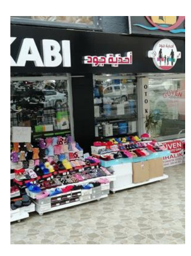
Figure 11: Syrian stores with Arabic and Turkish billboards in the streets of the study area

I have chosen to stay in this area because of the large number of Syrians, and the presence of Syrian shops where I can find what I need from the Syrian products", says a retired, fifty-year-old man.