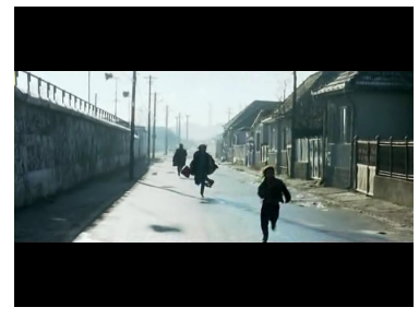
Image 9: In Gatlif's cinematography, photographic images of spaces contain rhizomatic meanings: Scenes from Korkoro and Transylvania.

Gatlif also presents a unique approach in terms of sound usage. For example, elements such as the overlapping voices in the documentary Indignatos, the successive utterance of the same words by both the narrator and different people in the film, and the asynchronous use of the voices of the characters who look at the camera and remain silent exemplify an original approach in the documentary style.