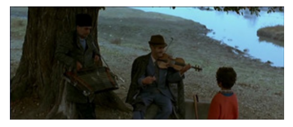
Image 5: Music and dance remind of the possibility of a non-linguistic relationality: Scenes from Geronimo and Latcho Drom.

The place of music and dance, which are the best representing elements of nomadic culture in Gatlif films, is almost equivalent to a protagonist. Music and dance in these films are tools that enable the others in the major structures to express the words of the minor and to say something for themselves. These sounds and melodies are deterritorialized by being detached from their context and become an element of alienation that disrupts the sensory-motor mechanism of the audience, an instrument that allows thought to sprout. In Transylvania , in the scene where Zingarina helps the old man, the anthem she sings while riding her bicycle, raising her hand as if on a walk ("Forward friends. Forward workers! Forward, comrades! Our red flag crosses borders! Our red flag crosses borders! Long live socialism and freedom!") stuters the narrative, produces a kind of reflexivity by alienating the viewer from the meta-order of the film. Within this preference of Gatlif, founding elements that are immanent to music like time, place, culture, and language all become invalid. Melodies and words that have no connection with the context it is in, derive suddenly from a dialogue related to other topics between the characters. Music and words become rhizomatic, turn into rhizomes.