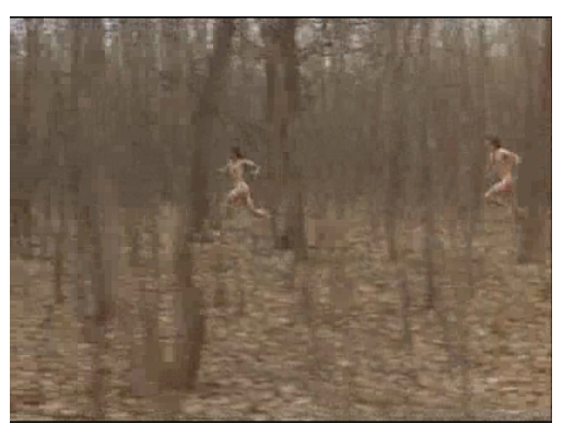
Image 4: Characters who integrate with nature step into being more than themselves: Scenes from Korkoro and Gadjo Dilo.