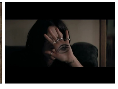
Image 7: In most of Gatlif's films, order gives way to carnivalesque: Scenes from Gadjo Dilo and Transylvania.

In Gatlif films, non-human beings also play an important role in the establishment of such an interaction and the formation of the carnivalesque structure. It is not only languages, places, characters, or music that are taken out of context in these films. Animals go through a similar fate. Animals, which are constantly included in the narrative with their voices and images, and the bonds they form with people in films, on the one hand, reflect an attitude that affirms difference and prioritizes a dialogic relation between species, and sometimes they are included in the film as a surprise element that brings randomness and uncertainty to the agenda. For example, a bear suddenly appears in an unexpected place in a town in Transylvania .