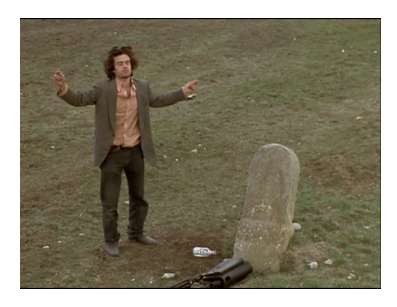
Image 3: The development of Gatlif's characters takes place in the form of a kind of deterritorialization: Scenes from Transylvania, Korkoro and Gadjo Dilo.

Deleuze and Guattari, describe such a kind of an irreversible deterritorialization as absolute deterritorialization. According to them (Deleuze and Guattari, 2005: 133), absolute deterritorialization is a liberation progress that opens up new ways which non-returning, bifurcated; and to indefinite probabilities. From this point of view, the transformation of the characters in Gatlif films into nomads can actually be interpreted as a liberation form that opens the characters to endless possibilities, renders the boundaries and obstacles meaningless, transforms them into purer souls in a symbolic sense. When considered in Deleuzian meaning, this situation of the characters fits the state described by the author as "becoming".