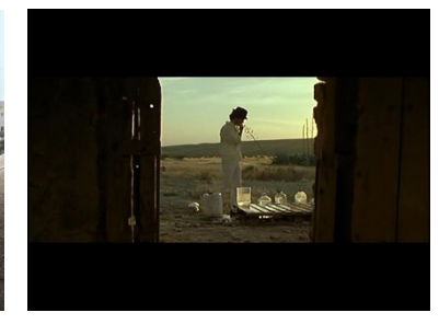
Image 6: Gatlif's spaces draw attention with their heterotopic features: Scenes from Transylvania, Djam and Exils.

This aspect of Gatlif's spaces brings to mind Michel Foucault's conceptualization of heterotopia. In his article, titled Of Other Spaces: Utopias and Heterotopias (1997) Foucault, describes heterotopia as a kind of in-between space. Heterotopias are areas of intersection that overlap disparate time layers or incompatible spaces. For example, cemeteries that unite life and death, which are impossible to coexist, or museums that allow different time layers to accumulate on top of each other are examples of heterotopias. Moreover, Foucault talks about the kinds and different features of heterotopia. One of the most distinctive features of heterotopia in the author's approach is that it is a transitional space between a site or civilization that exemplifies an oppressive life, and a utopia that describes an ideal life but only exists in dreams. Foucault describes heterotopia as a liberating space from the oppressive, anthropocentric, and exclusionary structure of the site, which provides a distance from the site. Just as heterotopia is an in-between space that allows the establishment of utopian dreams that can be an alternative to the site, in Gatlifin's films, characters who go beyond their major identities are also in a kind of search in these spaces.