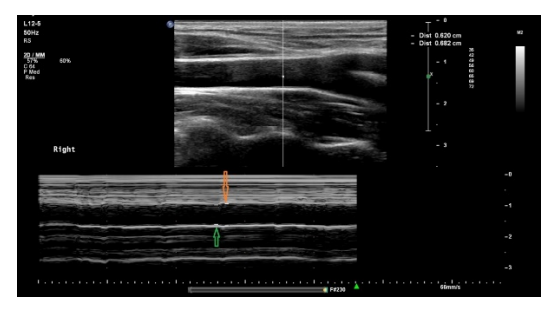
Figure 2. Measurement of systolic (orange arrow) and diastolic (green arrow) diameter on the right CCA artery.

Furthermore, the waist circumference of the participants was measured manually with a tape measure, males with a waist circumference of over 102 cm and females with a waist circumference of over 88 cm, and those with BMI>30 kg/m2 (body mass index) were excluded from the study<sup>18</sup>. The antidepressant doses taken by the patients were converted to fluoxetine equivalent doses with a dose equivalency method for standardization<sup>19</sup>.