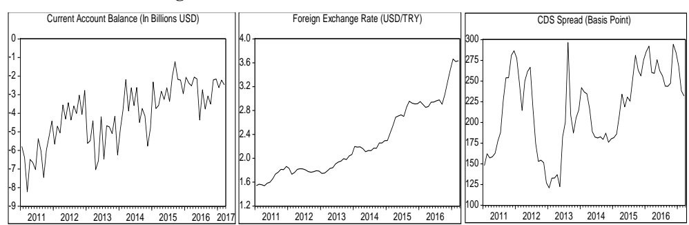
Figure 3. Time Series Plots of the Variables

Table 2. Descriptive Statistics of Data Set